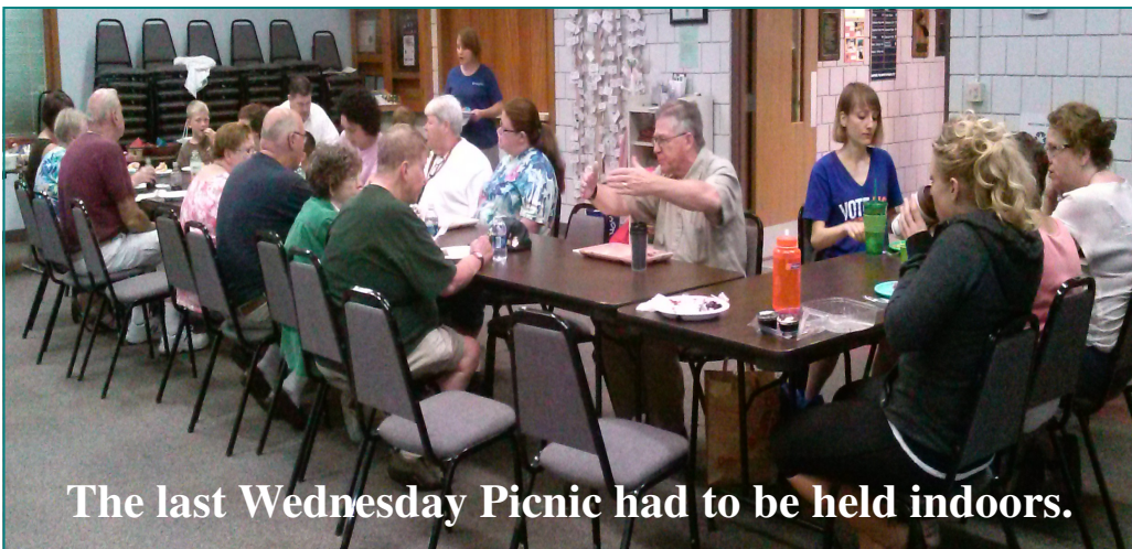
The last Wednesday Picnic had to be held indoors.